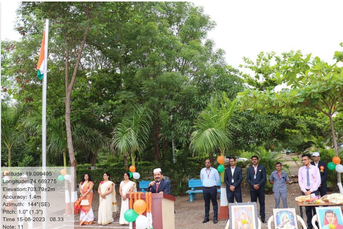
7.1.11.35 Independence Day