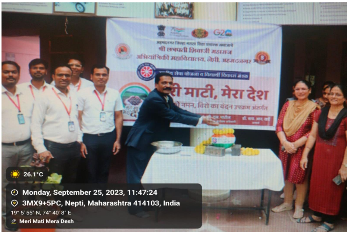
7.1.11.15 Meri Mati Mera Desh