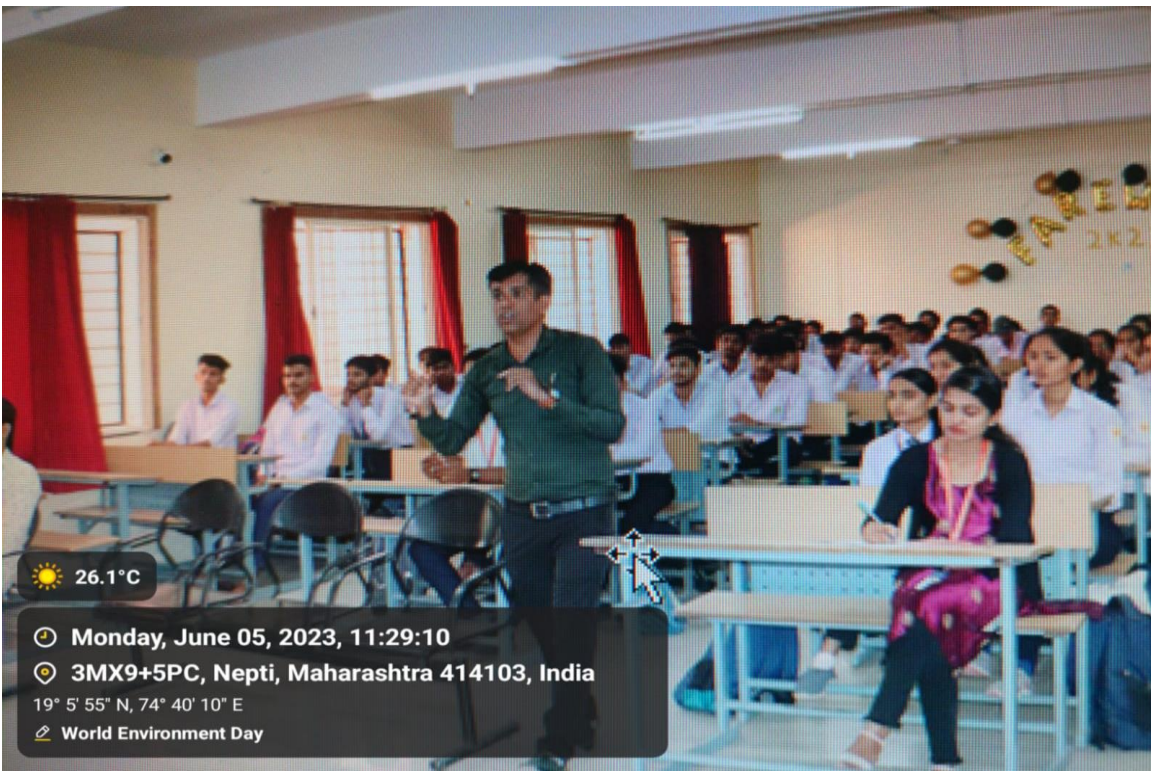
7.1.11.5 World Environmental Day