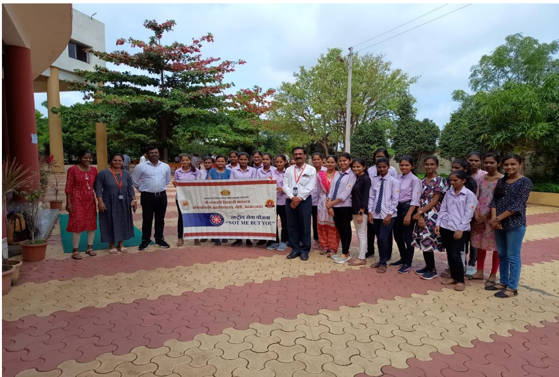
7.1.11.17 Gandhi Jayanti