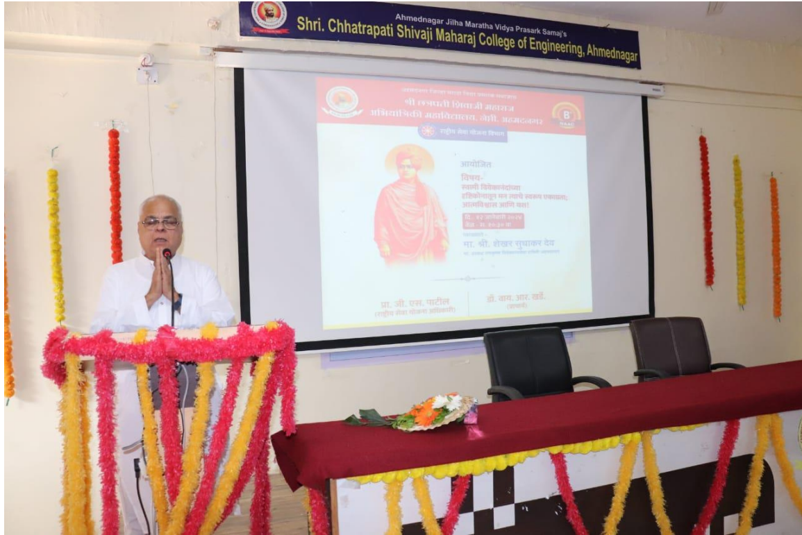
7.1.11.26 Swami Vivekanand Jayanti

Approved by AICTE New Delhi, Govt. of Maharashtra & Affiliated To Savitribai Phule Pune University.