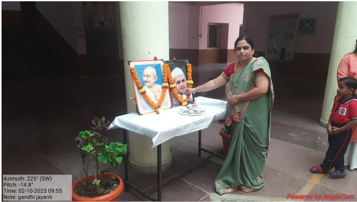
7.1.11.16 Gandhi Jayanti

Approved by AICTE New Delhi, Govt. of Maharashtra & Affiliated To Savitribai Phule Pune University.