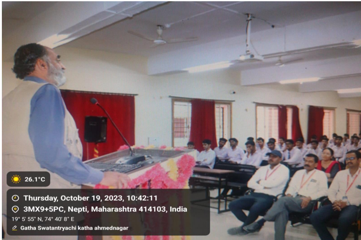
7.1.11.18 Gatha Swatantryachi Katha Ahmednagar chi

Approved by AICTE New Delhi, Govt. of Maharashtra & Affiliated To Savitribai Phule Pune University.