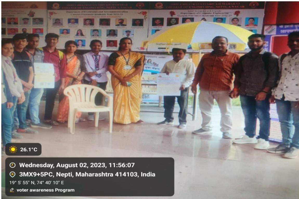
7.1.11.9 Voter Awareness Program