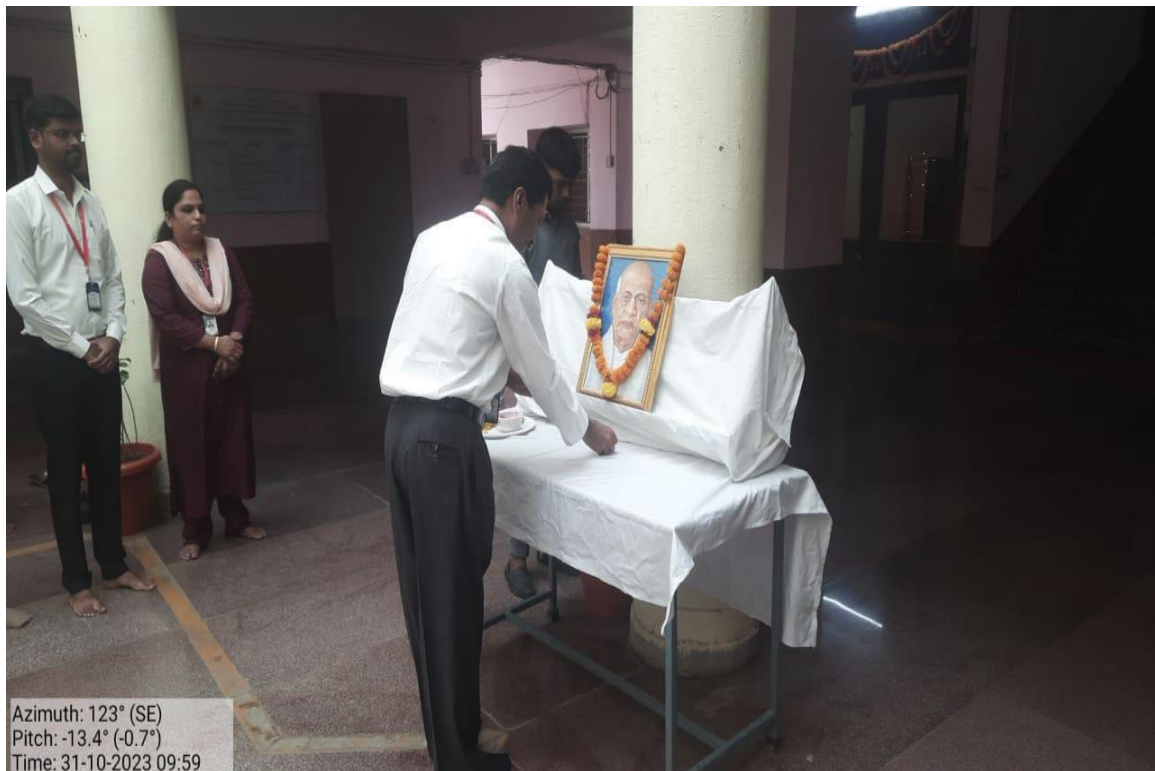
7.1.11.19 National Unity Day