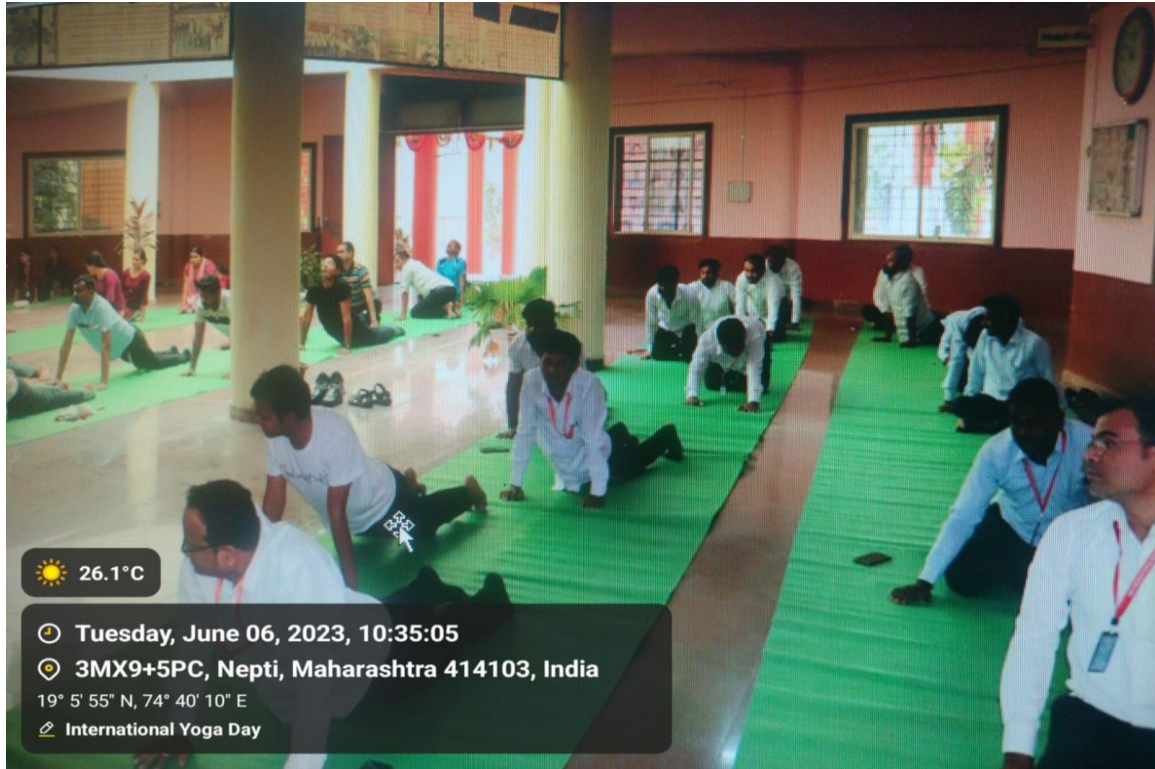
7.1.11.8 Inter National Yoga Day

Approved by AICTE New Delhi, Govt. of Maharashtra & Affiliated To Savitribai Phule Pune University.