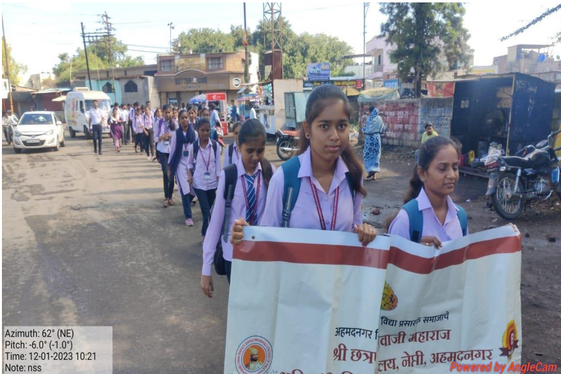
7.1.11.20 World Aids Day

Azimuth: 62° (NE) Pitch: -6.0° (-1.0°) Time: 12-01-2023 10:21 Note: nss