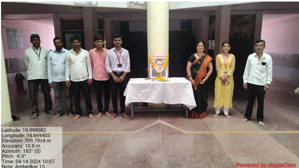
7.1.11.3 Dr. Babasaheb Ambedkar Jayanti