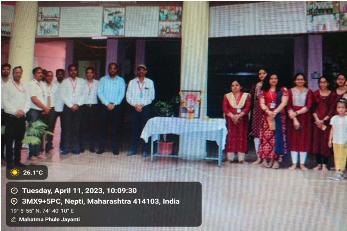
7.1.11.2 Mahatma Phule Jayanti

Approved by AICTE New Delhi, Govt. of Maharashtra & Affiliated To Savitribai Phule Pune University.