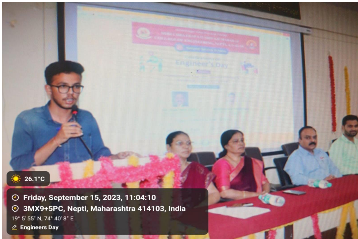
7.1.11.13 Engineers Day