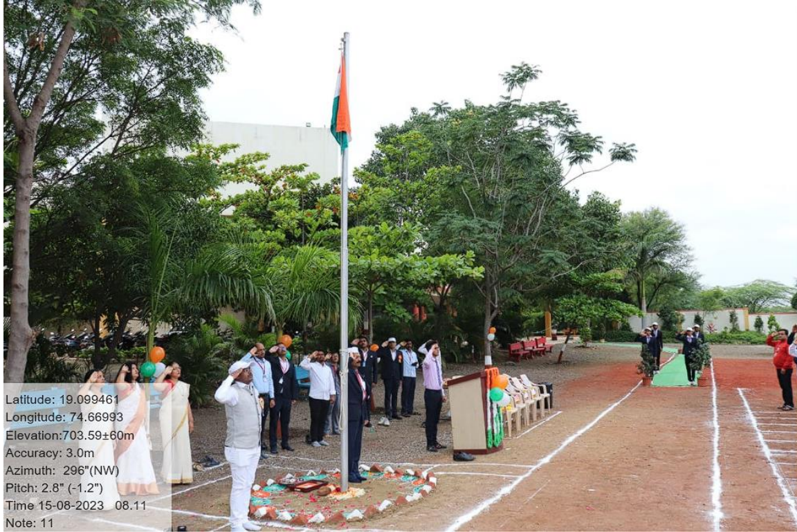
7.1.11.36 Independence Day

Approved by AICTE New Delhi, Govt. of Maharashtra & Affiliated To Savitribai Phule Pune University.