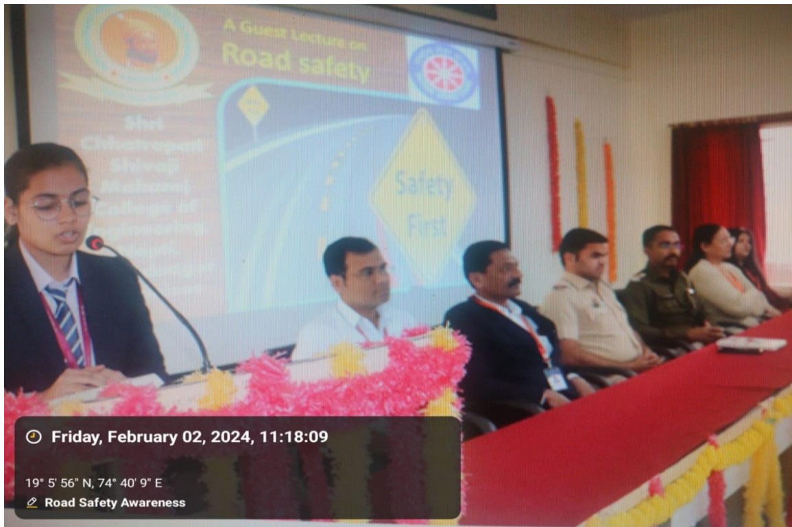
7.1.11.24 Road Safety Awareness