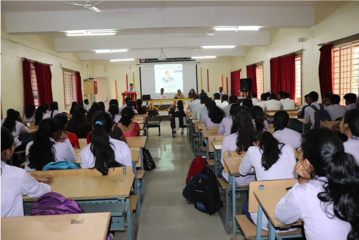
7.1.11.4 Dr. Babasaheb Ambedkar Jayanti

Approved by AICTE New Delhi, Govt. of Maharashtra & Affiliated To Savitribai Phule Pune University.