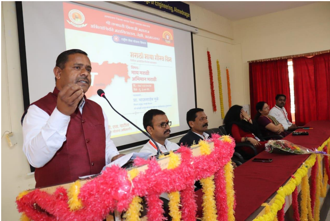
7.1.11.34 Marathi Bhasha Din

Approved by AICTE New Delhi, Govt. of Maharashtra & Affiliated To Savitribai Phule Pune University.