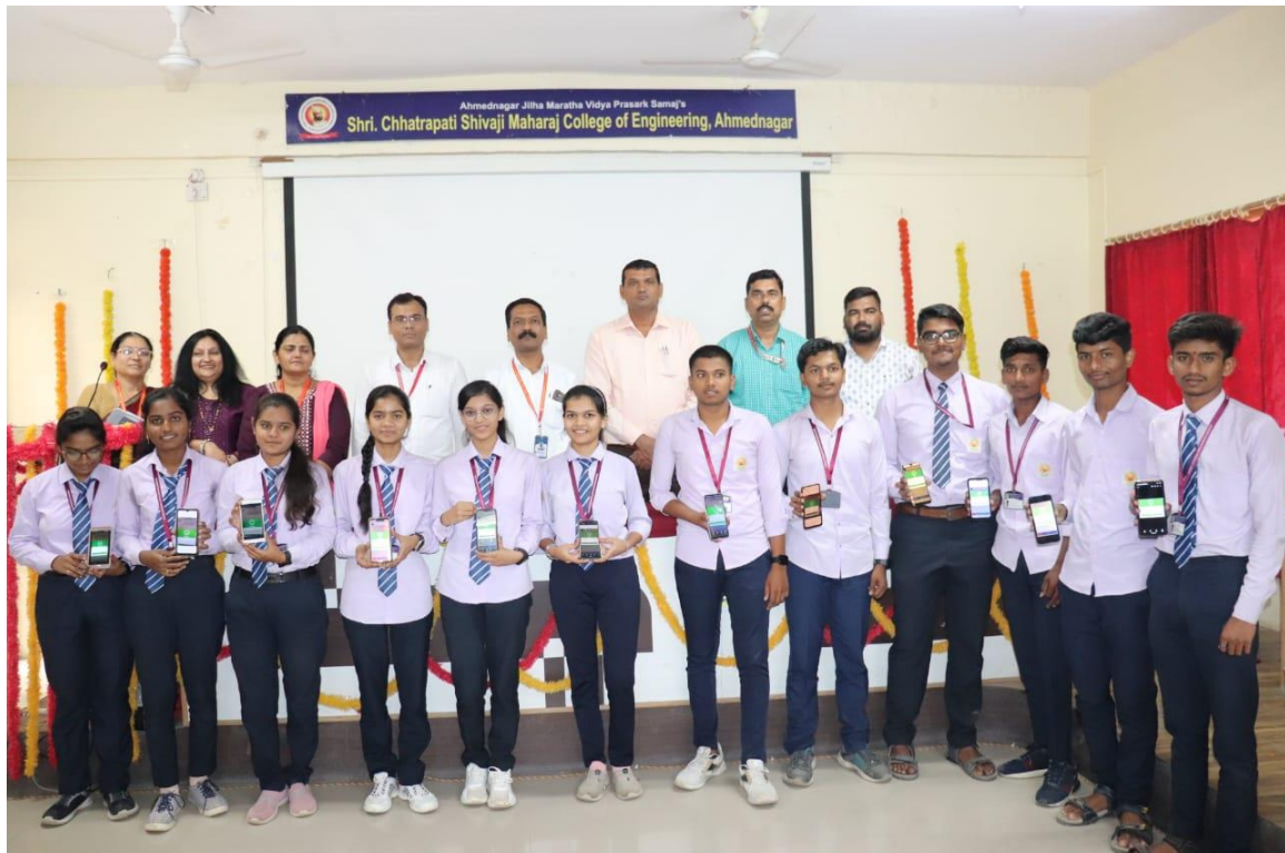
7.1.11.23 Voter Registration Drive