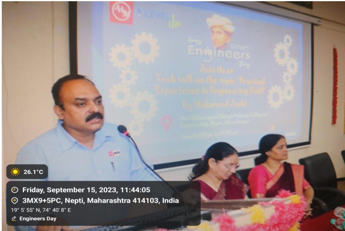
7.1.11.12 Engineers Day

Approved by AICTE New Delhi, Govt. of Maharashtra & Affiliated To Savitribai Phule Pune University.