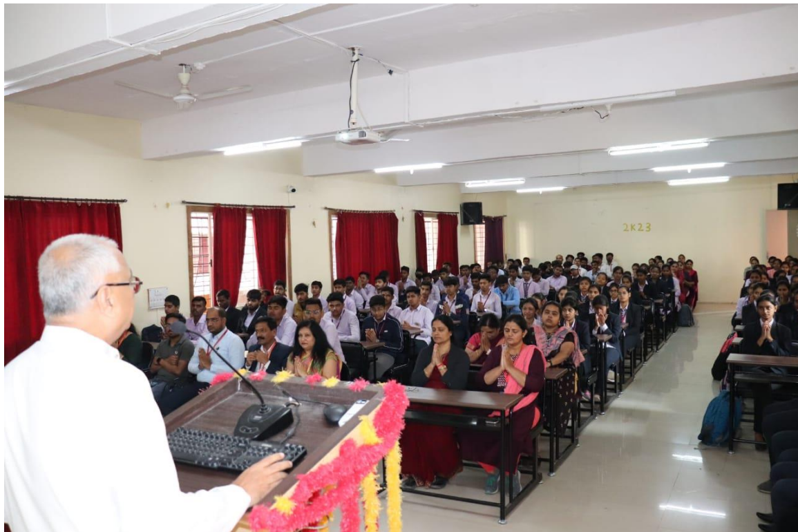
7.1.11.27 Swami Vivekanand Jayanti