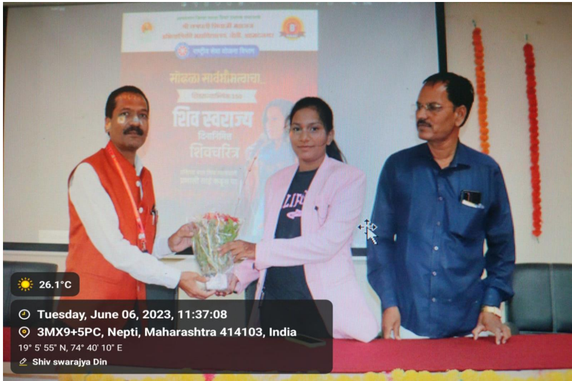
7.1.11.6 Shiv Swaraj Din

Approved by AICTE New Delhi, Govt. of Maharashtra & Affiliated To Savitribai Phule Pune University.