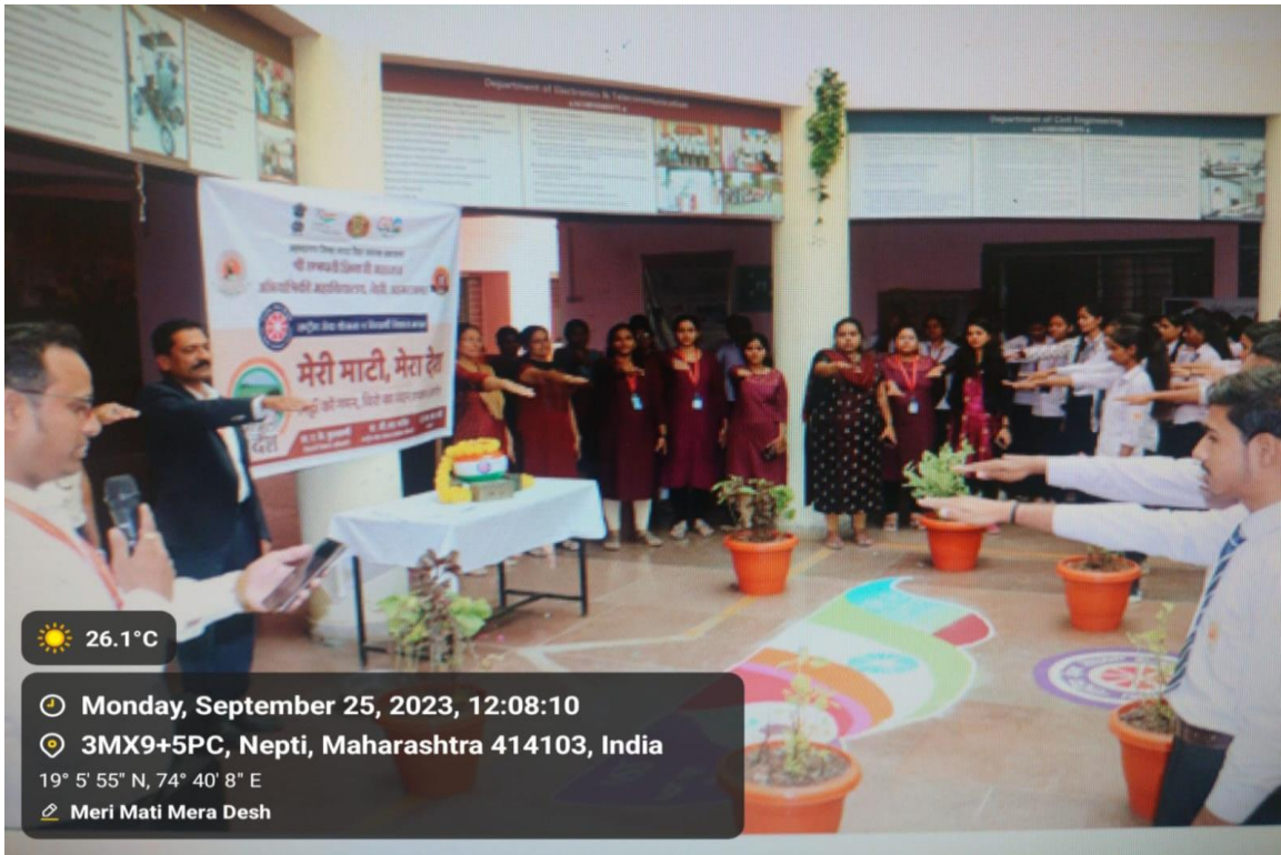
7.1.11.14 Meri Mati Mera Desh

Approved by AICTE New Delhi, Govt. of Maharashtra & Affiliated To Savitribai Phule Pune University.