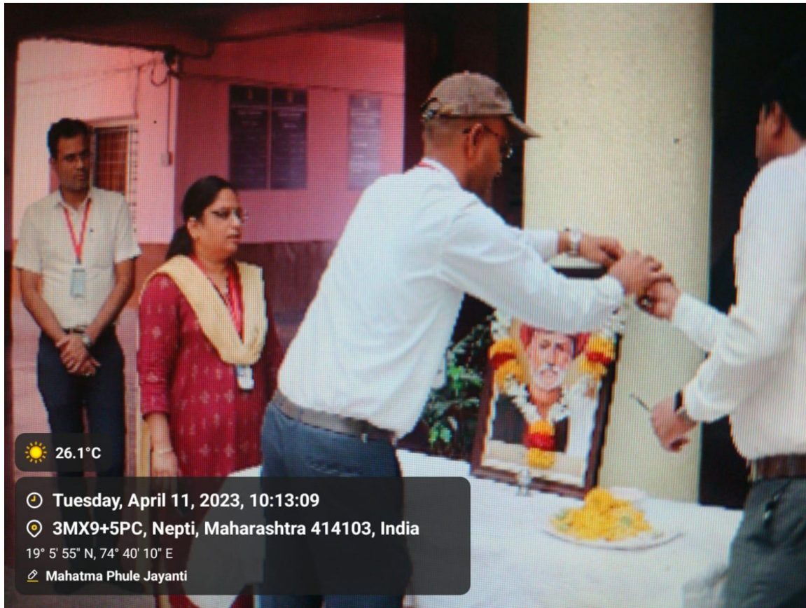
7.1.11.1 Mahatma Phule Jayanti