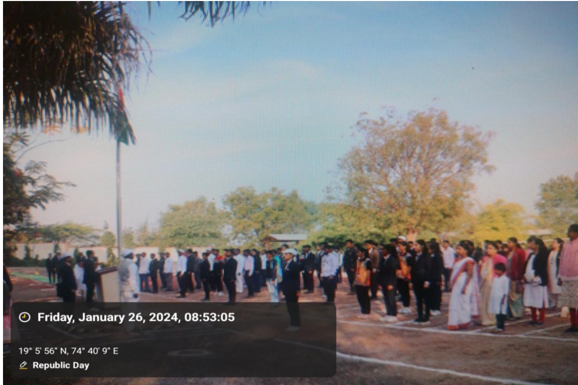
7.1.11.28 Republic Day

Approved by AICTE New Delhi, Govt. of Maharashtra & Affiliated To Savitribai Phule Pune University.